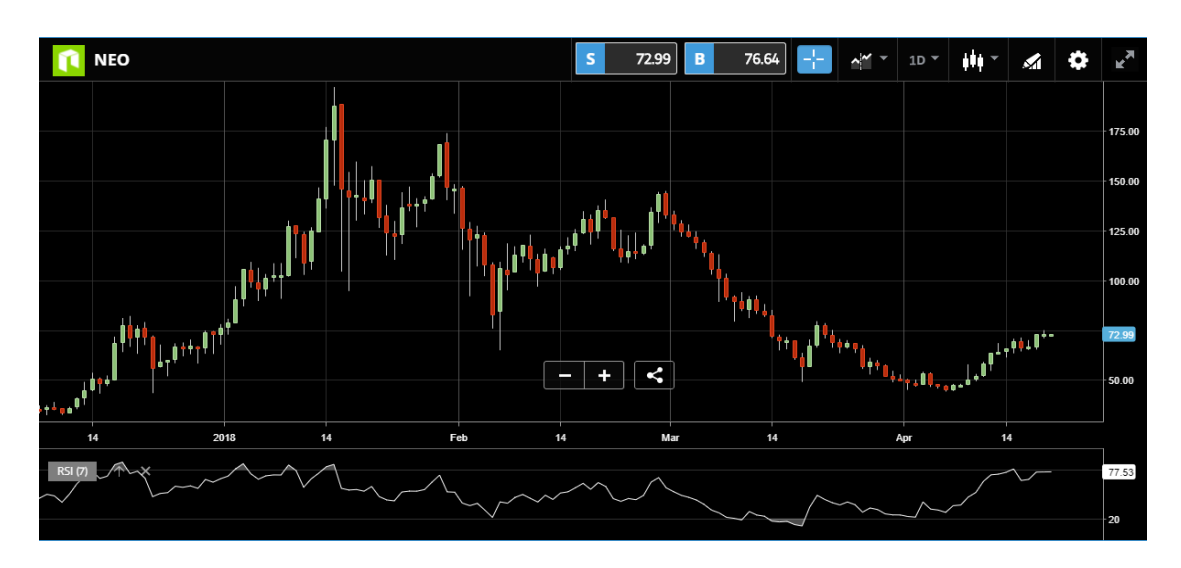
Exhibit 3: Evolution of NEO/USD price since December and 7-day RSI indicator.

The last few days have shown a relief of this correction, although as seen on Exhibit 3 the high values of the Relative Strength Index (RSI) indicator could suggest that NEO is slightly overbought right now. The whole cryptocurrency market is currently longing for a bull-run driven by Bitcoin , but any fundamental developments on the space (whether positive or negative) could drive the trend of the following month.