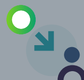
Giving to another person (excluding spouse)